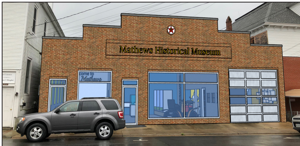
Perspective view of the front of the planned Mathews Historical Museum.

www.mathewsvmuseum.org • mathewsvirginiamuseum@gmail.com • mayfairemathews@gmail.com