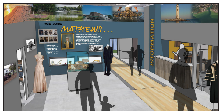
Views of front gallery, above, and back gallery, below.

The next two perspectives show the gallery spaces. The first view is as one enters the building from Main Street and the other is of the gallery in the back of the building.