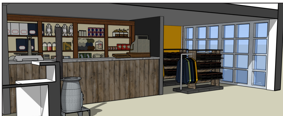
Country store and retail area.

In closing I would like to thank the board members for all of their hard work in helping the museum develop. And I thank all of the volunteers who have helped make our special events and activities successful. Without their hard work we would not have accomplished all that we have been able to do.