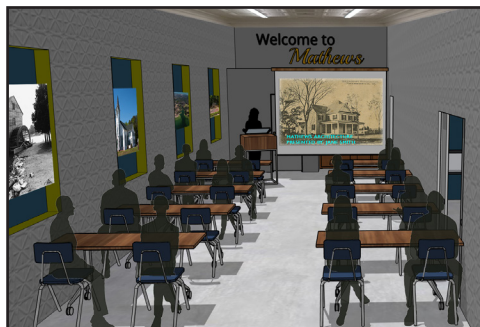
Lecture, meeting, and activity room.

The next perspective is of the Lecture, Meeting, and Activity Room.